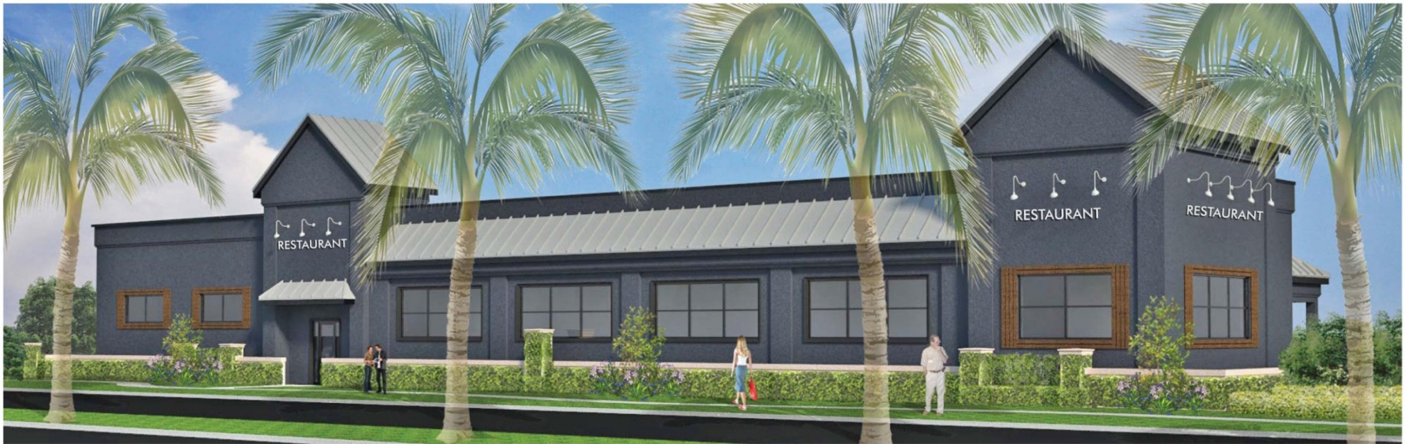
Conceptual Rendering - View from US Hwy 1 / South Dixie Hwy

The site is easily accessible for both vehicles and pedestrians due to signalized intersections, three vehicle access points into the site, and public transit operations including Miami's Metro Rail, Metro Bus and the complementary Coral Gables Trolley.